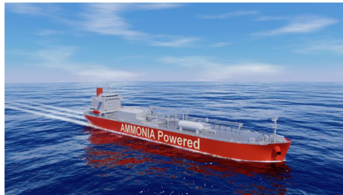
CG rendering of an ocean-going liquefied gas carrier