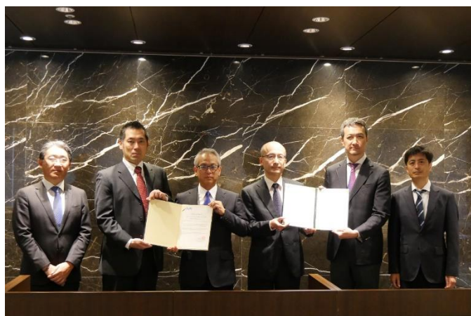
AiP Certificate Presentation Ceremony